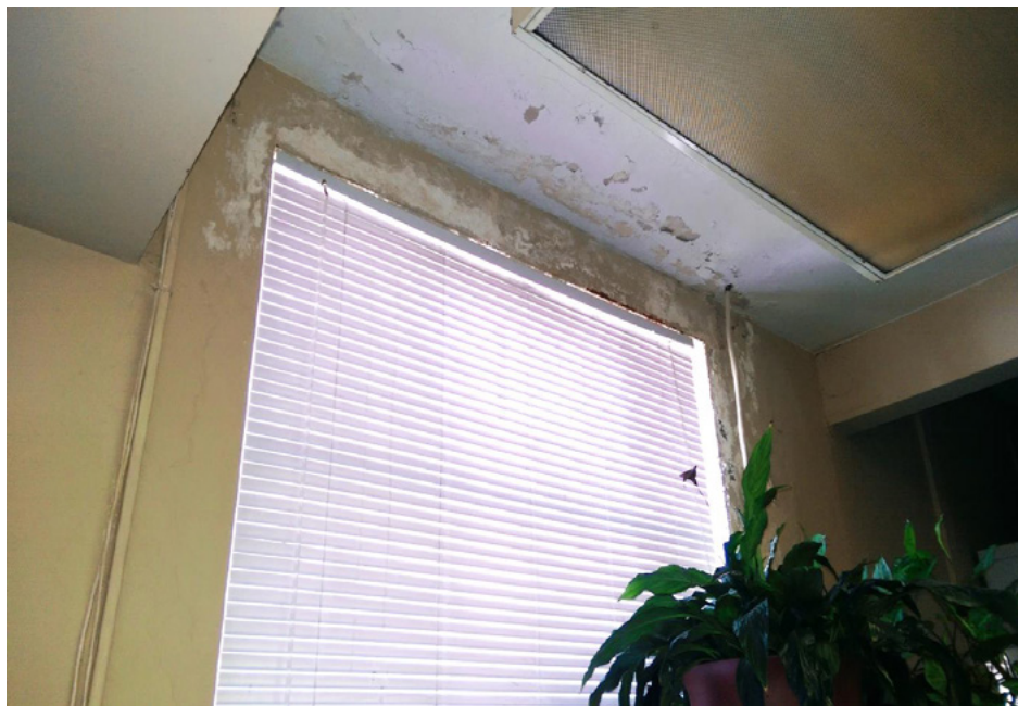
Figure 8. Water intrusion near an office window, September 2014.

The drainage gutter located above rooms 124 and 125 in the office area was not properly directed away from the wall and toward the drain. Instead, this spout was open toward the wall, which allowed rain water to run down the wall of the building. The improper drain system and the compromised flashing around the window in room 124 allowed water intrusion into the room around the window (Figure 8).