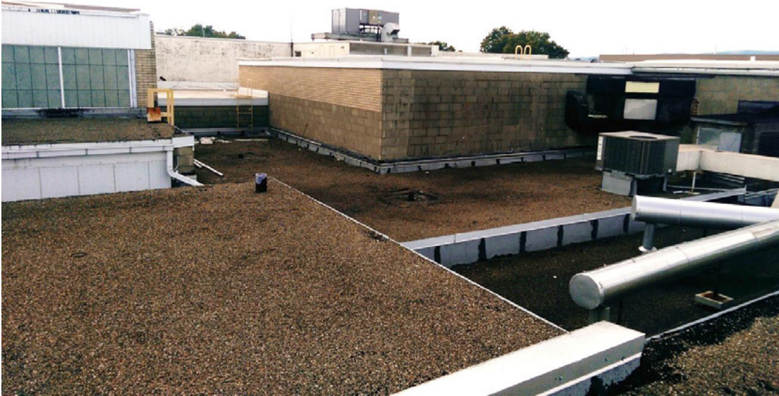
Figure 1. Facility top with multiple levels, September 2014.

The roof had many different levels (Figure 1). We observed standing water in many areas on the facility's flat roofs (e.g., warehouse, maintenance department, chip packing, and frying room) and at the edge of the gable roof adjacent to chip packing and fryer room. Standing water near the edge of the gable roof of the chip processing, packing, and storage building can be seen in Figure 2 below.