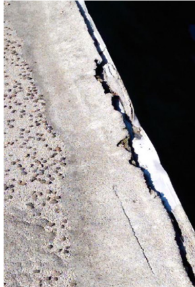
Figure 5. A gap identified at the roof and wall joints of the storage building located near the corn processing area, September 2014.

We observed damaged roof flashing and caulking at the joints between two buildings and at areas where the walls and roof met. The roof flashing at the joint between the wall and roof of the warehouse building was missing (Figure 5).