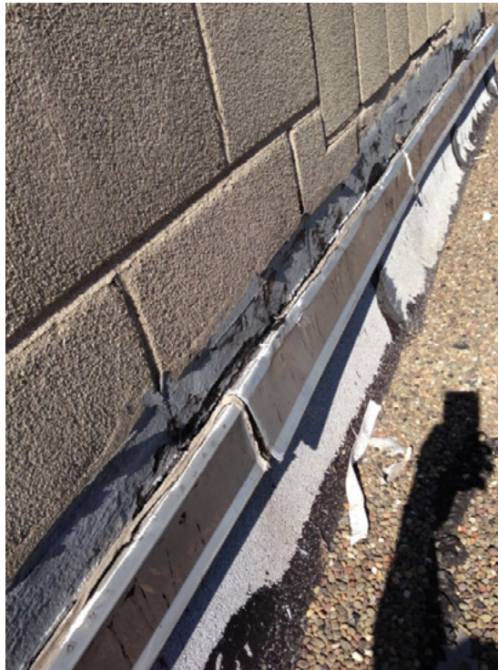
Figure 6. Damaged roof flashing and disintegrated caulking on the roof above the accounting and general office areas, September 2014.

We observed gaps at joints around the older buildings that possibly allowed rain water intrusion. The flashing and caulking at the wall and roof joint above the corridor by the general and payroll office areas were disintegrated (Figure 6).