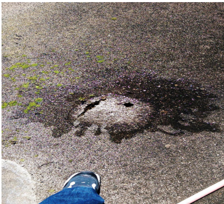
Figure 4. Rain water trapped between two layers of patched roofing materials, September 2014.

Many of the roof drain covers in those areas on the roofs were clogged with leaves or debris that prevented proper drainage of rain water and resulted in pooled water on the roofs. Roofing materials above the maintenance department, chip processing, and administrative offices were disintegrating and in need of repairs (Figure 3). Specifically, the roof of the maintenance department had holes in the double-patched roofing material that allowed rain water to be trapped between the layers (Figure 4).