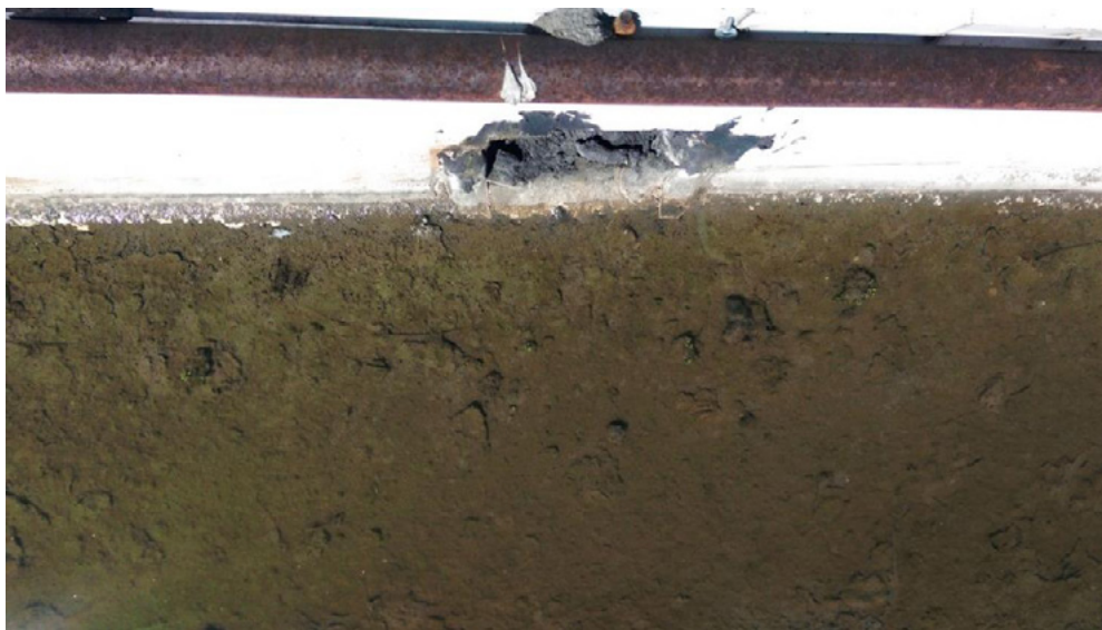
Figure 3. Hole in damaged roofing materials, September 2014. Hole was located near the water pool seen in Figure 2.

Many of the roof drain covers in those areas on the roofs were clogged with leaves or debris that prevented proper drainage of rain water and resulted in pooled water on the roofs. Roofing materials above the maintenance department, chip processing, and administrative offices were disintegrating and in need of repairs (Figure 3). Specifically, the roof of the maintenance department had holes in the double-patched roofing material that allowed rain water to be trapped between the layers (Figure 4).