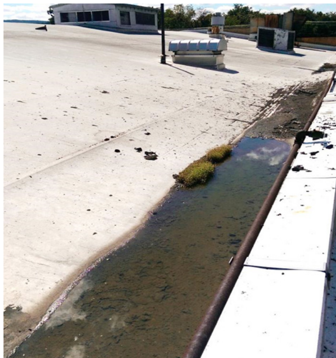
Figure 2. Pooled water near the edge of the gable roof of the chip processing and storage building, September 2014.