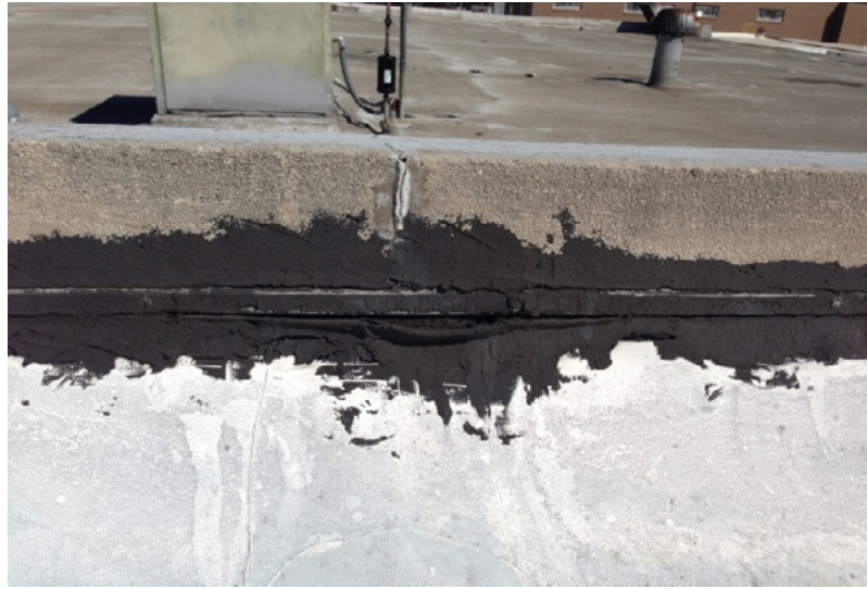
Figure 7. Damaged roof flashing and caulking at the joint between the two buildings of the maintenance department and repacking areas, September 2014.

The disintegrated flashing and caulking allowed water to get indoors, particularly in the payroll office areas. We also observed cracks on caulking at the roof joint between the maintenance department and repacking area (Figure 7).