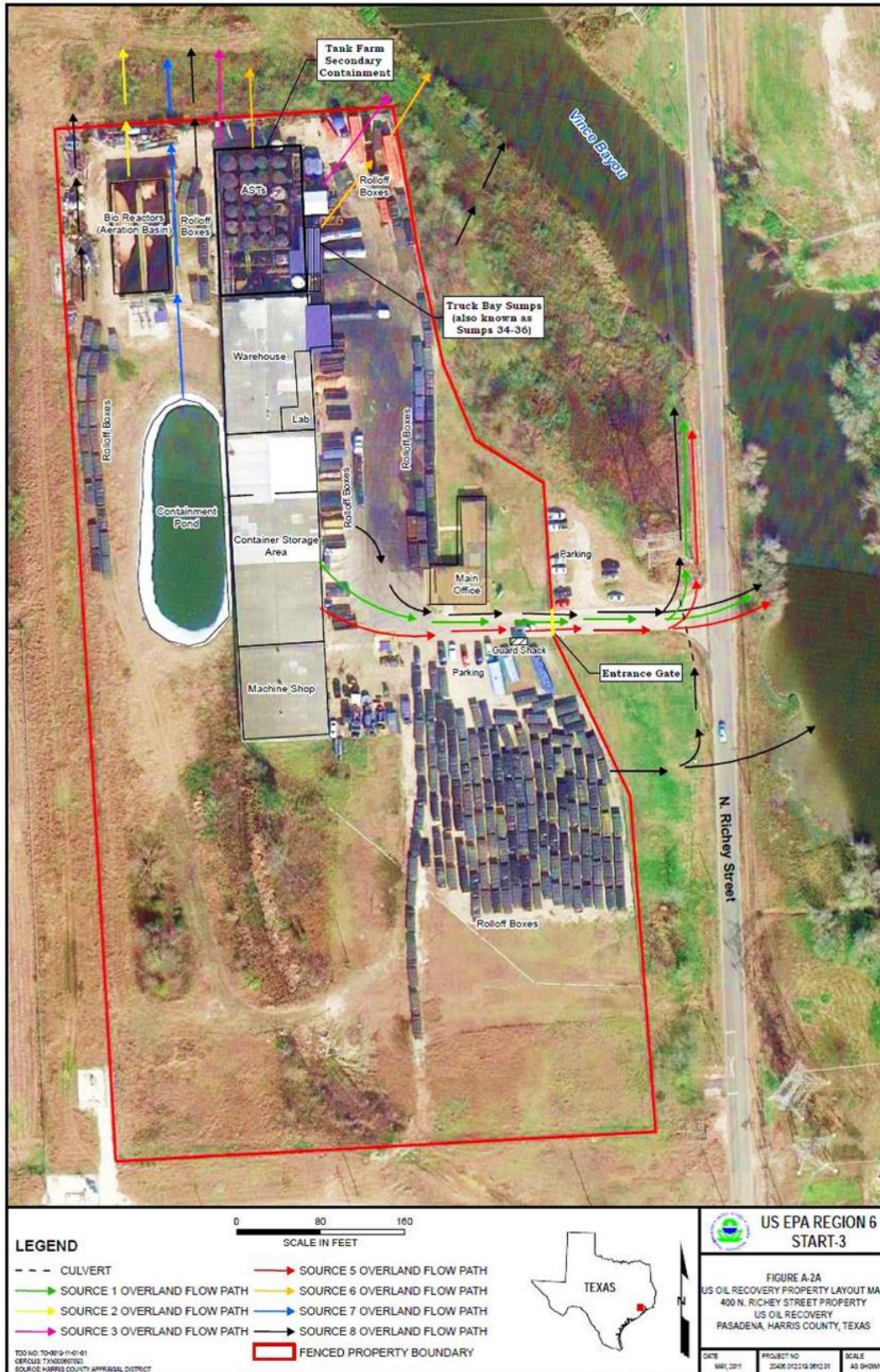
Figure 3. Drainage pathway for the US Oil Recovery facility (USEPA 2011a).