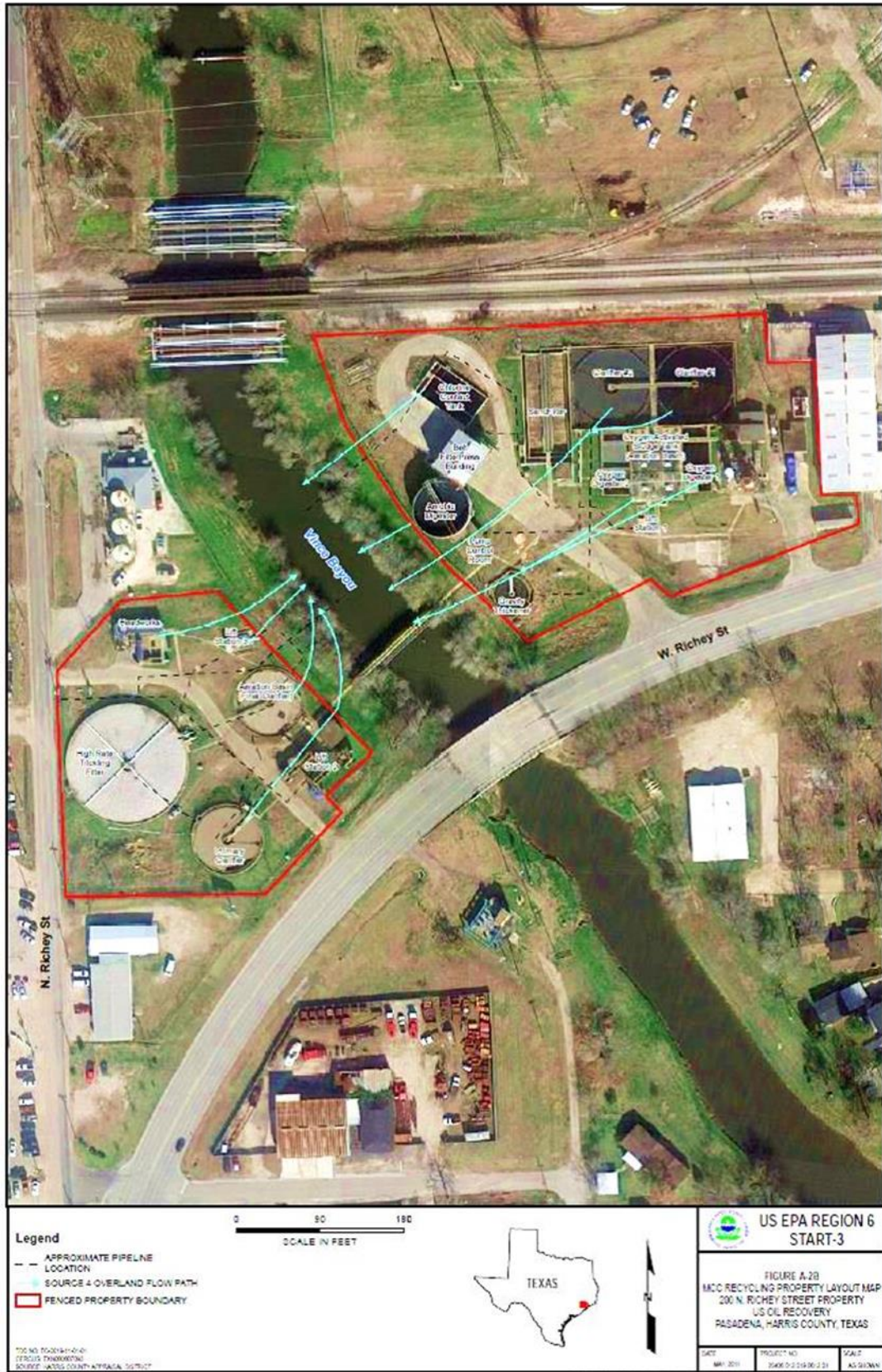
Figure 4. Drainage pathway for the MCC Recycling facility (USEPA 2011a).