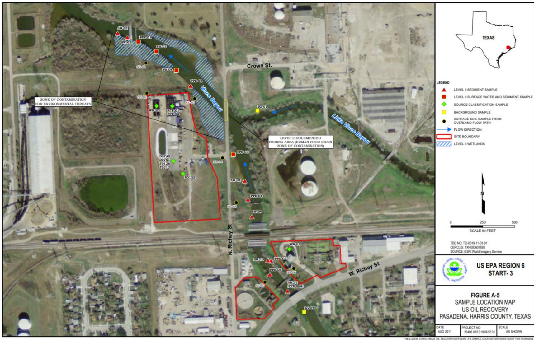
Figure 5. Map shows soil and sediment sampling locations (US EPA 2011a)