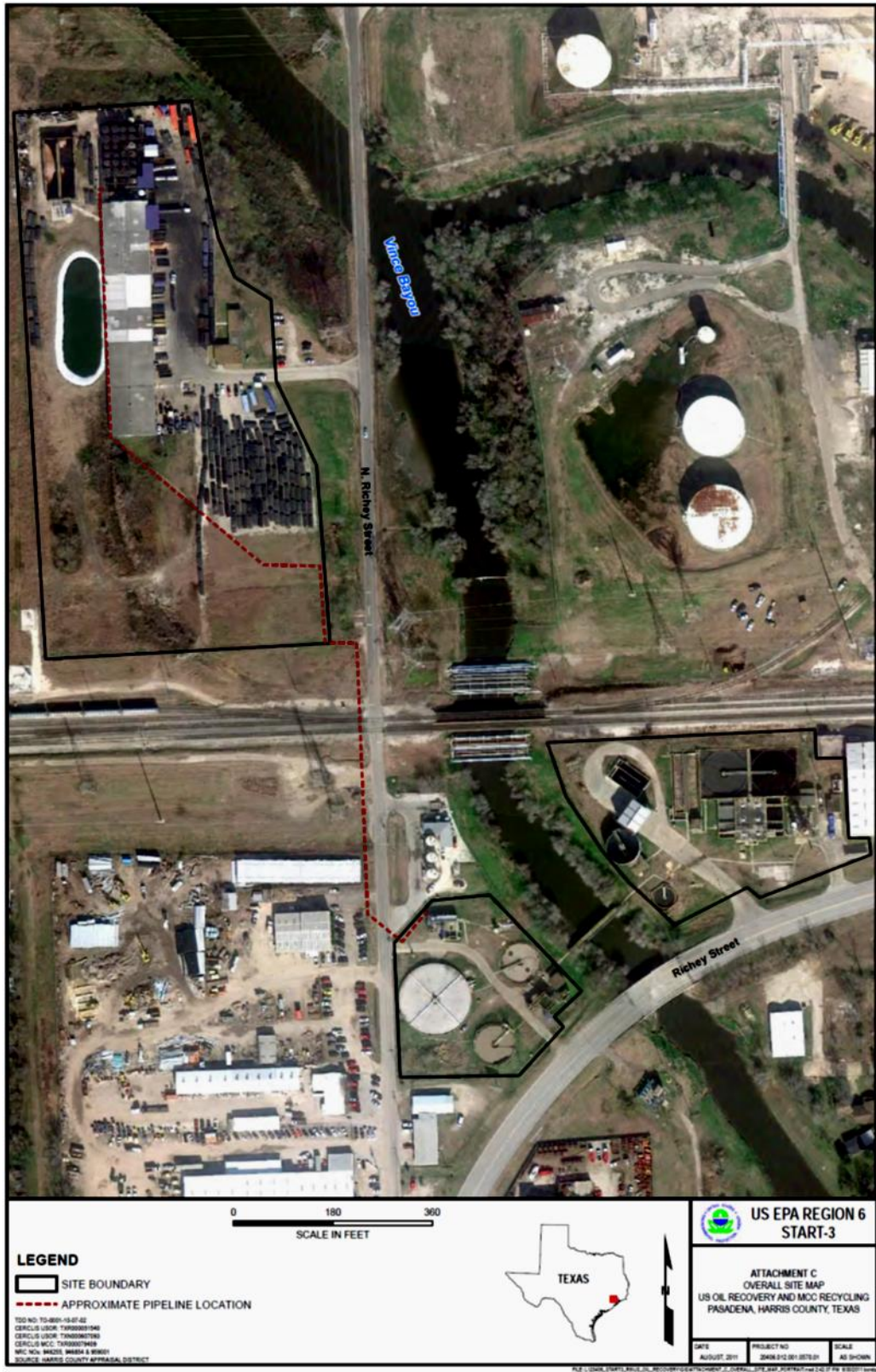
Figure 1. US Oil Recovery Superfund site map (USEPA 2011b).