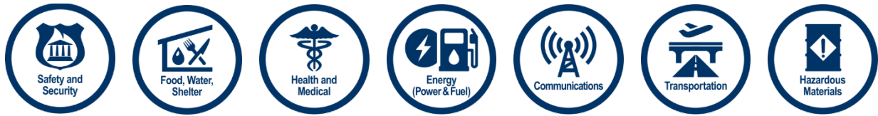
Figure 1: The Seven Community Lifelines

These lifelines enable the continuous operation of government functions and critical business and are essential to human health and safety or economic security. Each lifeline is comprised of multiple components and subcomponents.